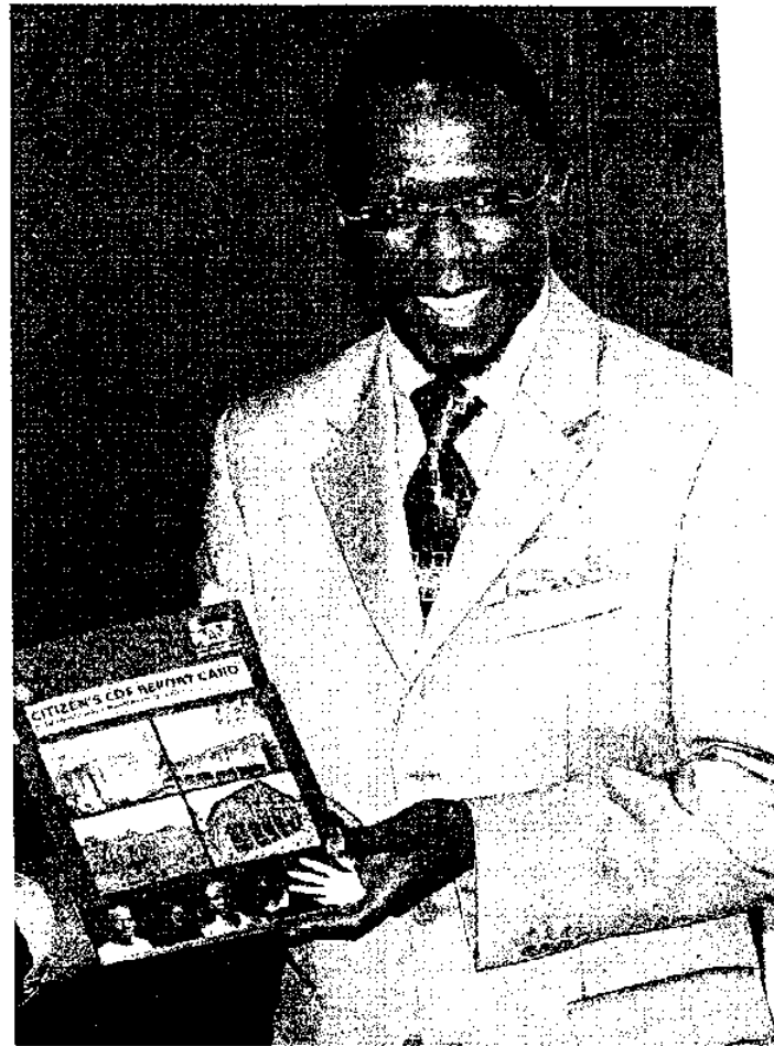
Budalang'i MP Ababu Namwamba launches the Citizen's CDF Report card documenting misuse of constituency development funds at The Stanley hotel yesterday. The

The other one is the Dandora/Mailisaba foot bridge, which by the time of the study, no CDF account had been spent on it, despite allocations amounting to Sh1.3m in the two financial years under study.