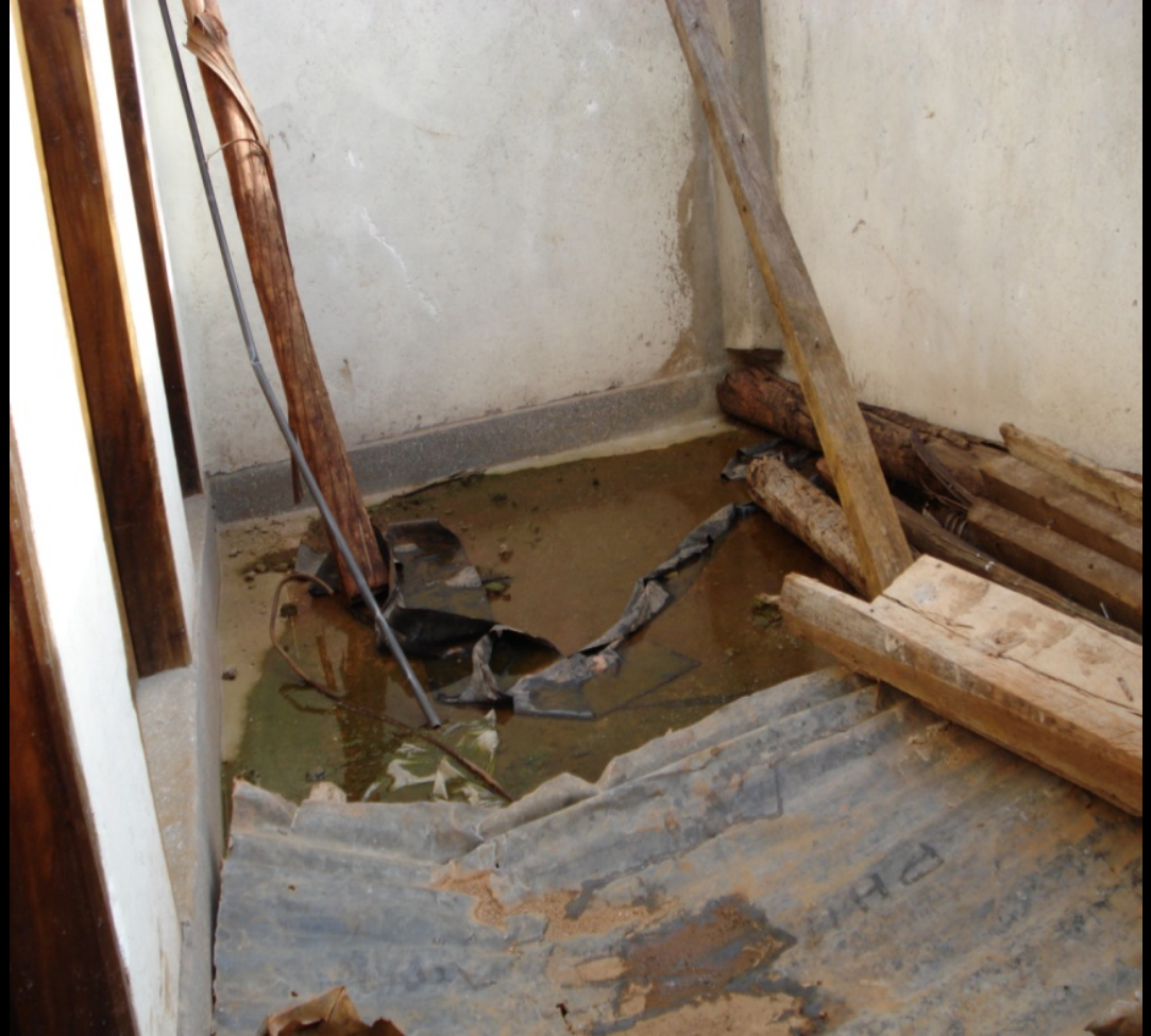
Public Toilets for Fish Mongers – Busia Town Western Kenya