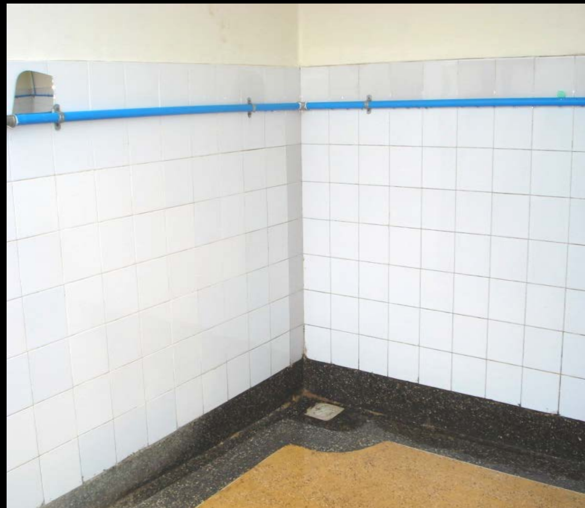
Public Toilets for Fish Mongers – Busia Town Western Kenya