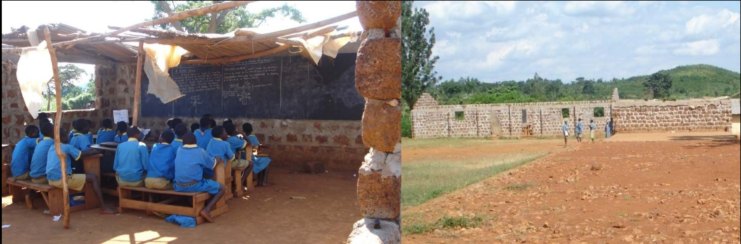
Bwangangi Primary School – Funyula Constituency Western Kenya