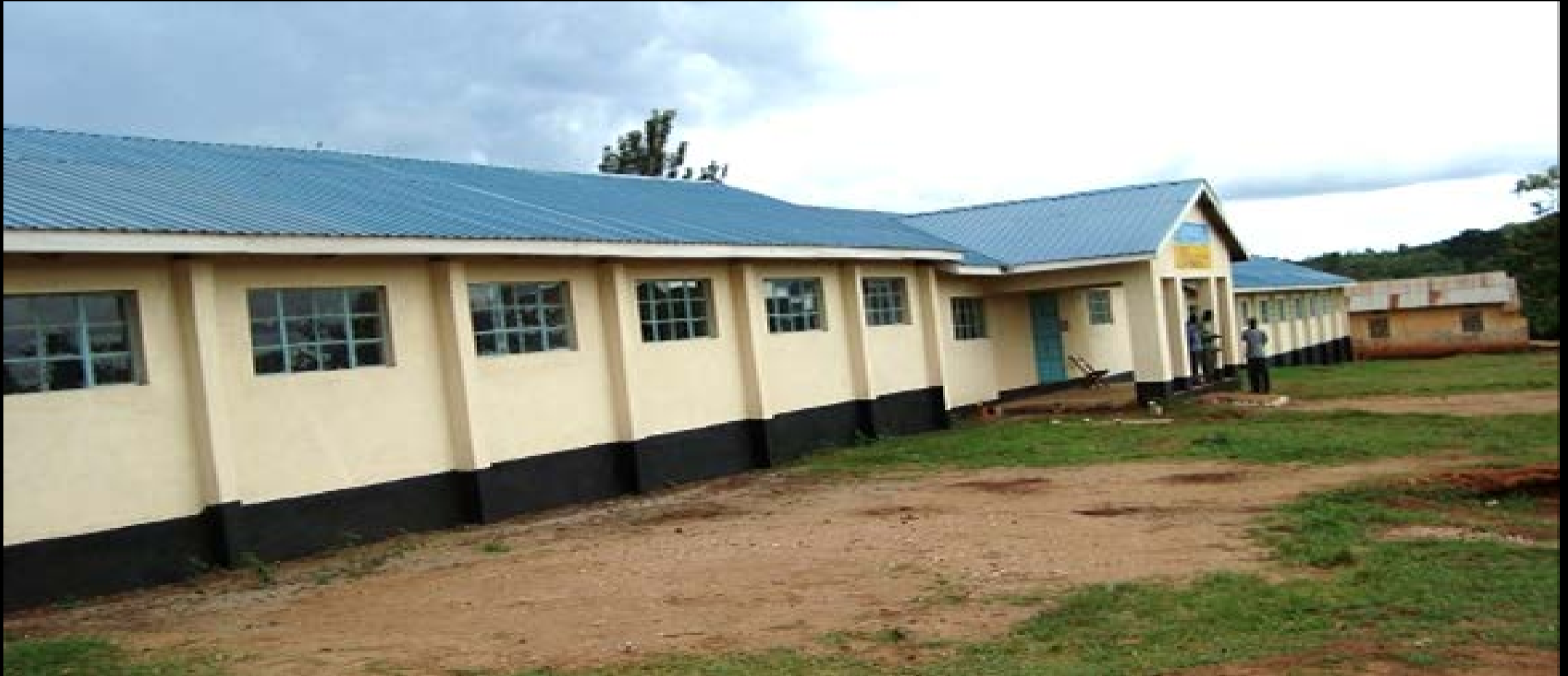
Bwangangi Primary School – Funyula Constituency Western Kenya